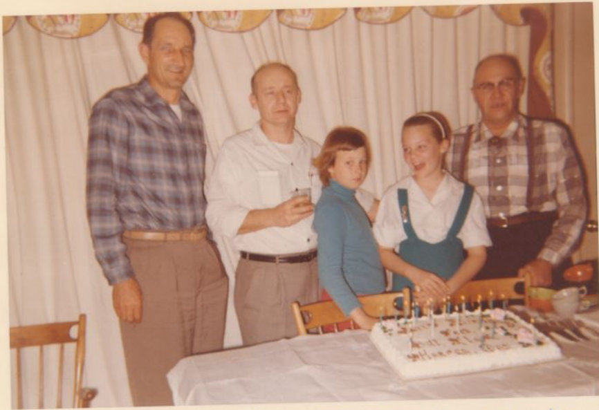
BIRTHDAY PARTY CONCORD CAL. 60