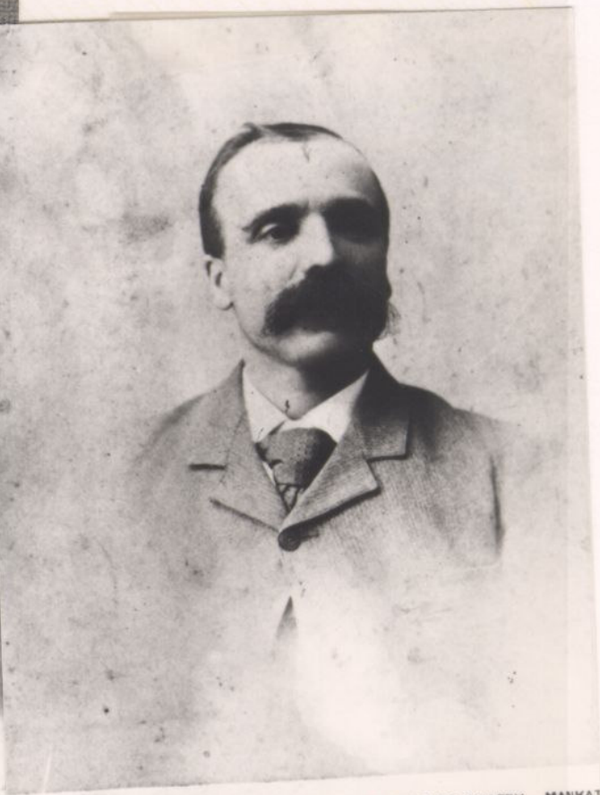
MORE LIKE THIS CAN BE HAD AT ANY TIME AT KEENE'S GALLERY MANKATO