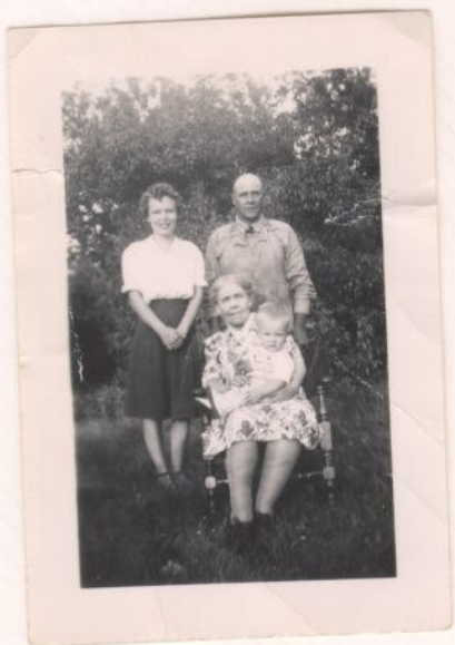
4 Generations G-twt - baby