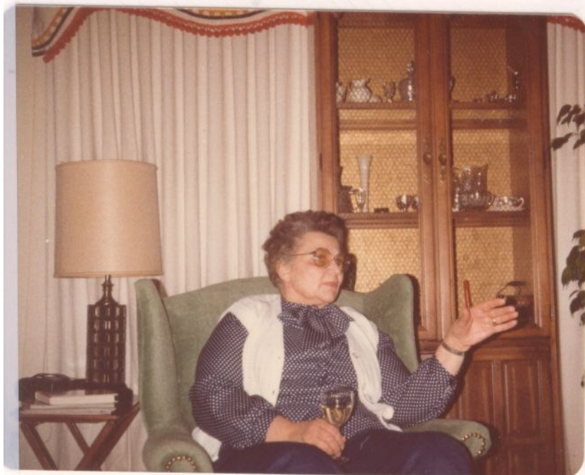
ELDORA + STANLEY