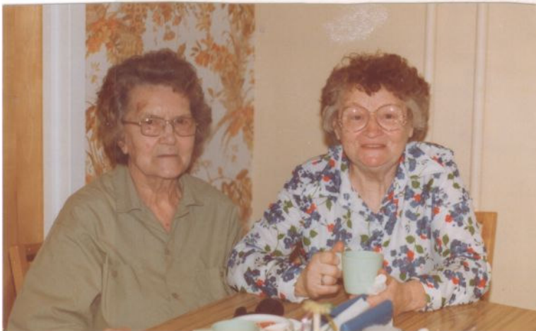
WITH SISTER MILKO