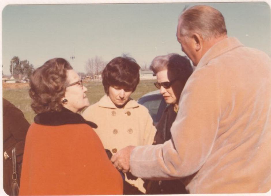
AT Rys Funeral