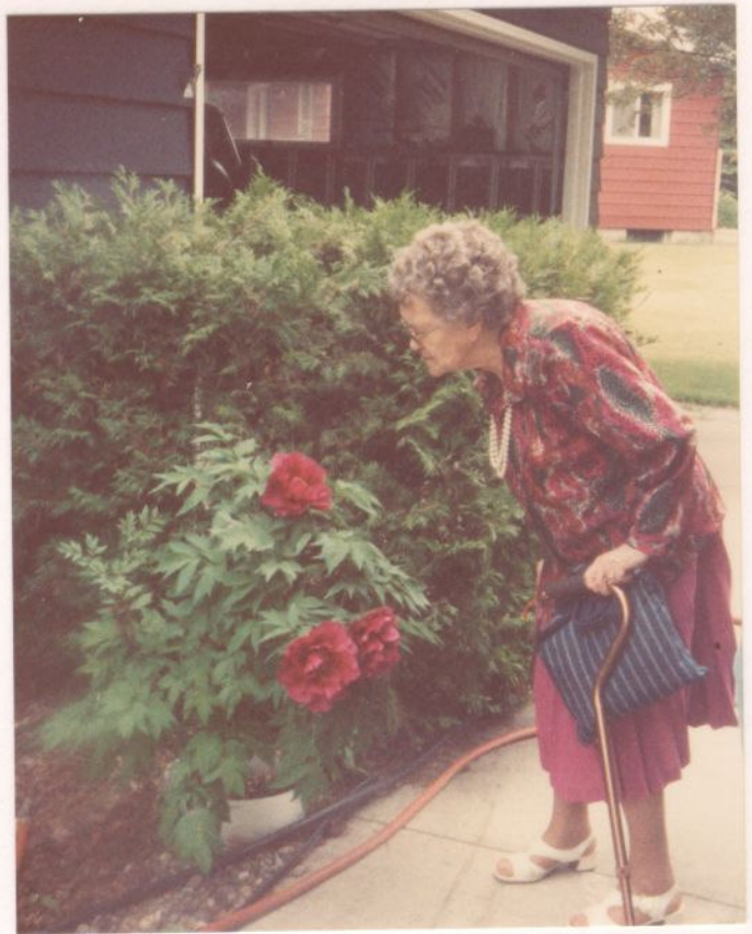
AT THE TWO VALLEY RETIREMENT CENTER